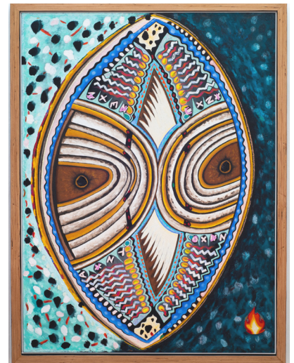
Sweet Fire , 2024, oil, acrylic, and canvas with artist-made frame, 58 x 43 1/2 in.