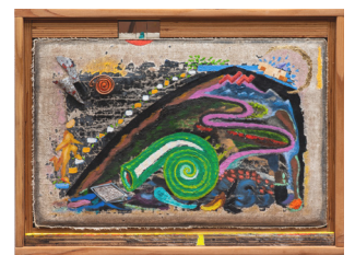
Midnight Electrician , 2025, oil, foil, copper coil, gold leaf, linen, mirrors and turquoise on linen with painted wooden frame, 13 1/2 x 18 in.