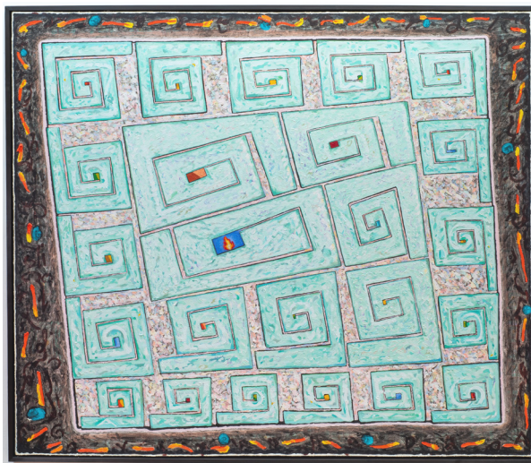
Open this wall , 2024, oil, acrylic and canvas on canvas with painted and burnt wood frame, 74 x 86 in.