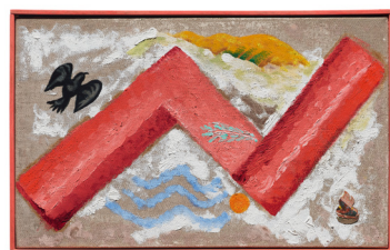
begin again begin , 2011-25, oil on linen, canvas, wood, and nails, 11 x 16 1/2 x 1 1/4 in.