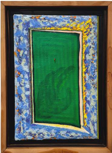
A Tender Victory , 2012-25, oil and copper nail on linen, artist made frame 14 1/2 x 10 1/2 x 2 1/4 in.