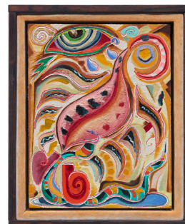
Hotel Principal , 2024 oil on panel, wood, and nails, 12 1/2 x 10 x 1 3/8 in.