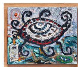
alacran candles , 2024, oil on panel, wood, and nails, 16 x 19 x 1 1/4 in.