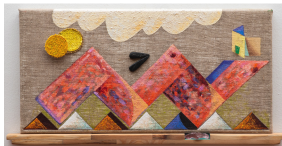
dueño del sueño , 2025, oil, wood, jute, paper and linen on linen with wooden frame and collected glass insert, 11 x 22 in.