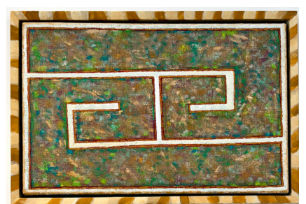
Magico , 2025, oil on linen, artist-made frame, 13 1/2 x 18 3/4 x 1 1/2