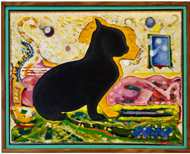
BB Chiskis , 2012-25, oil and jute on linen in artist made frame, 26 3/4 x 21 x 1 3/4 in.