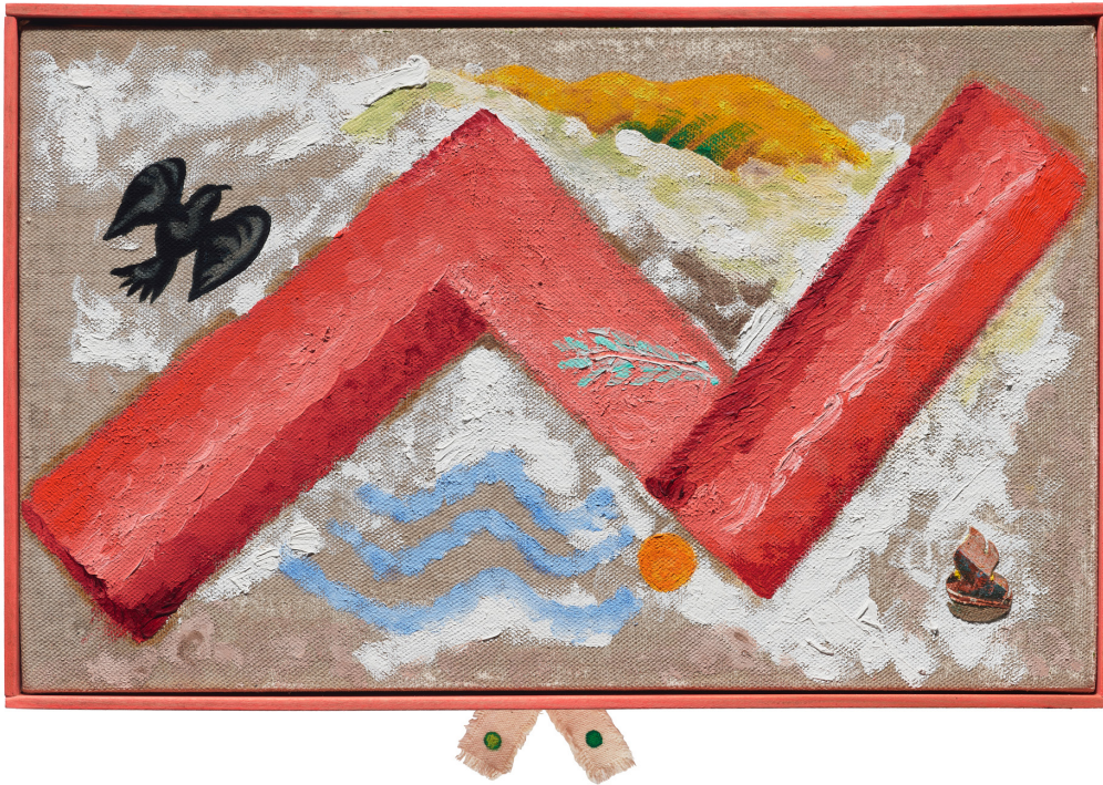
begin again begin , 2011-25 oil on linen, canvas, wood, and nails 11 x 16 \frac{3}{4} x 1 \frac{1}{4} in.