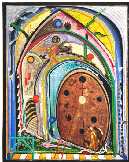
Love Heart Cheat Code , 2012-2025, oil, jute, gold leaf on linen in artist-made frame, 31 1/2 x 26 x 1 3/4 in.