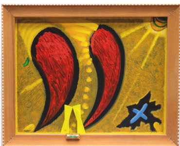
two of cups , 2025, oil, acrylic, wood, jute, gold leaf, construction level on wood with wood stretcher bar frame, 16 x 20 in.