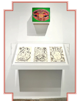
install view: aídos , 2024, oil on canvas(es) and wood, 11 1/2 x 14 1/2 x 9 1/2 in.